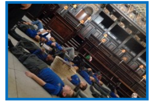
We lay down in the choir pit to look at the beautiful mosaics that were designed by Sir Christopher Wren. He was the architect that redesigned London after the great fire.