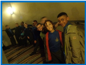
We climbed 528 steps to get to the Whispering Gallery at the top of the

We visited St. Paul's Cathedral. St Paul's Cathedral is a building in the City of London that was originally burnt down in the Great Fire of London. We learnt all about how the people of 1666 fought off the fire but also how the fire destroyed much of the city.