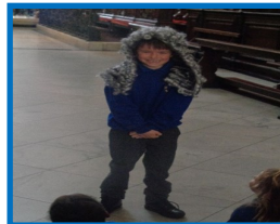
King Charles II (Charlie) ordered for the houses to be blown up using gunpowder. This eventually stopped the fire.